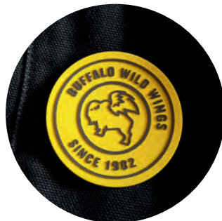
MOLDED PATCH (ONE PIECE)