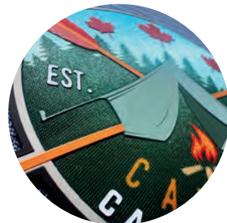
PRINTED ON FABRIC