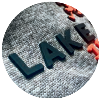
MOLDED APPLIQUE (SEPARATED ELEMENTS)

Silicone Emblems and Transfers are one of the most trending design techniques of the decade. These 3D, flexible, smooth emblems are durable in harsh conditions and never fade over time. The variety of silicone techniques shown below make silicone emblems a modern and unique addition to apparel, bags, shoes, promotional swag and more!